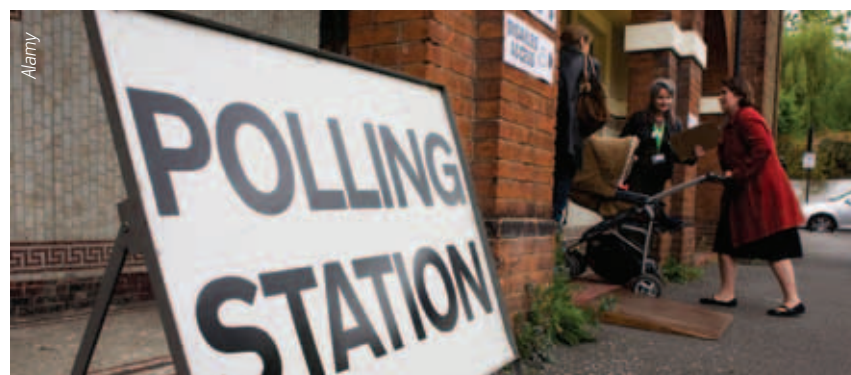
Voting is already compulsory in Belgium, Italy and Australia