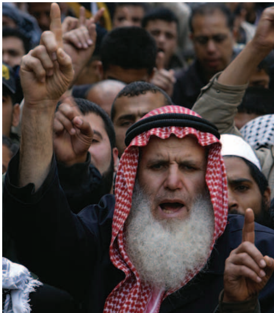
Many Muslims differ on the definition of jihad