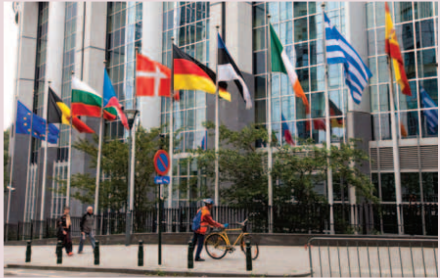
The coalition government has compromised on both sides in relation to Europe

The traditional Franco-German motor of integration has lost traction due to diverging