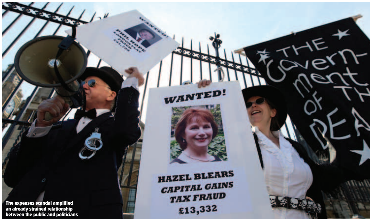
The expenses scandal amplified an already strained relationship between the public and politicians