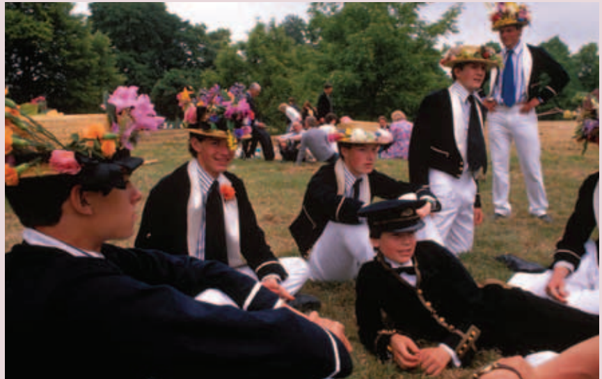
Will a large number of MPs still be private school-educated by 2040?

For one, it established clear blue water between the coalition's emphasis on improving