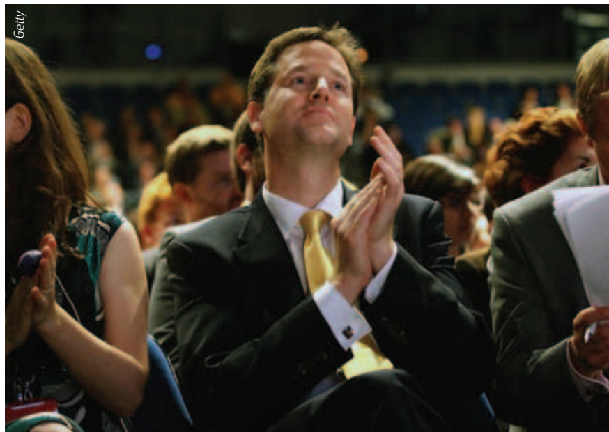
Nick Clegg is hoping for more Liberal Democrats in Parliament under the proposed system