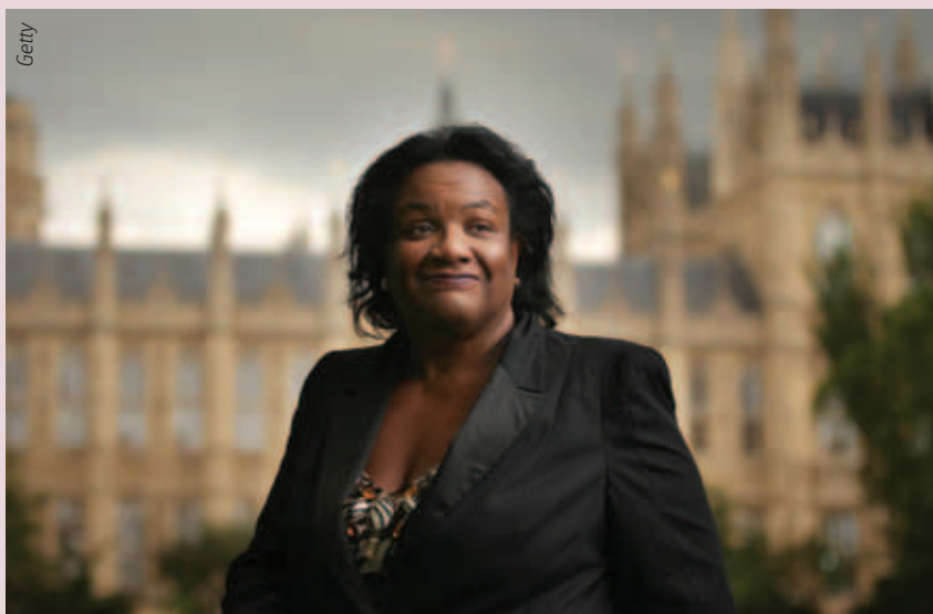
Diane Abbott has campaigned on women's issues in the Commons for over 20 years