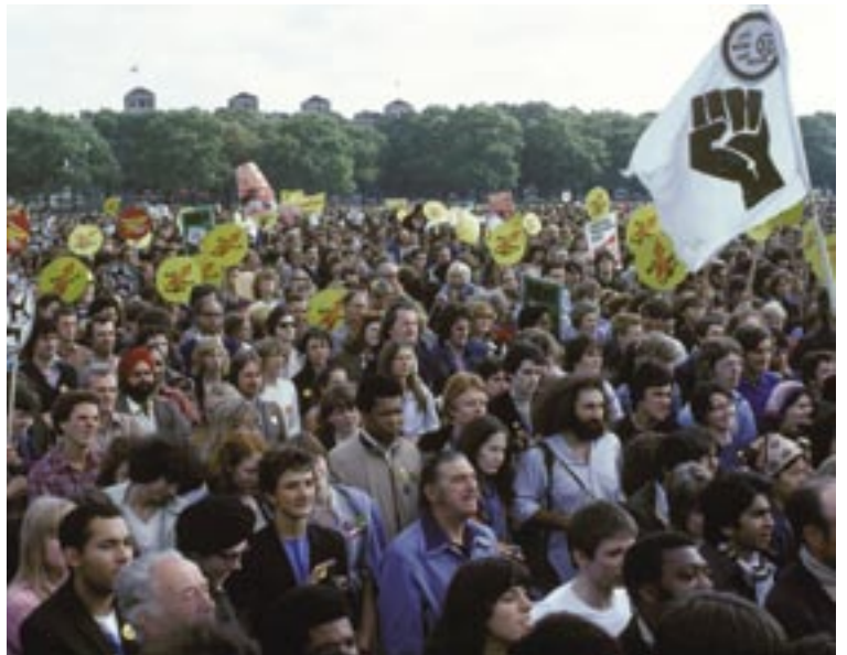
Rock Against Racism was perceived by many as being a musical wing of the Socialist Workers Party.

Jubilee 2000/Live 8 was very different, according to the research: 'Here we are talking about elite negotiations between managers, musicians, NGOs, music industry executives and television companies to create particular kinds of media events. Live 8 cost £10 million to organise.'