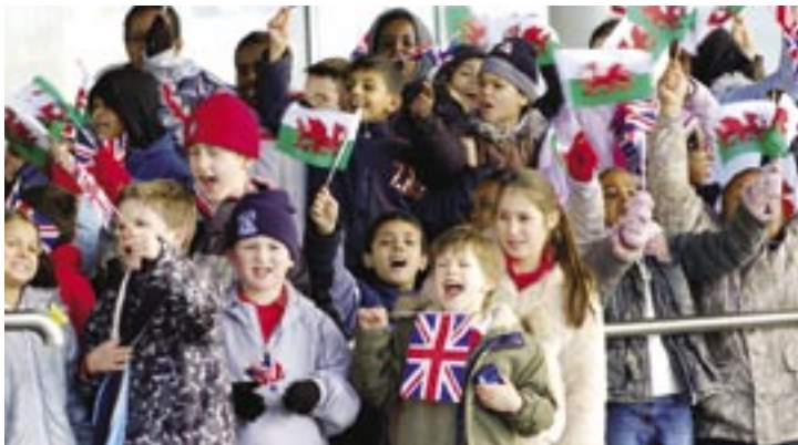
Despite devolution in Wales, the number of Welsh people who regard themselves as British has remained at a steady level.

► What this debate has shown up is that under this scrutiny, 'Britishness' proves fragile. It is a relatively recent construction, the product of an intense period of nation-building in the wake of the Acts of Union between England and Scotland in 1707, and superimposed on earlier national identities such as English, Scottish and Welsh.