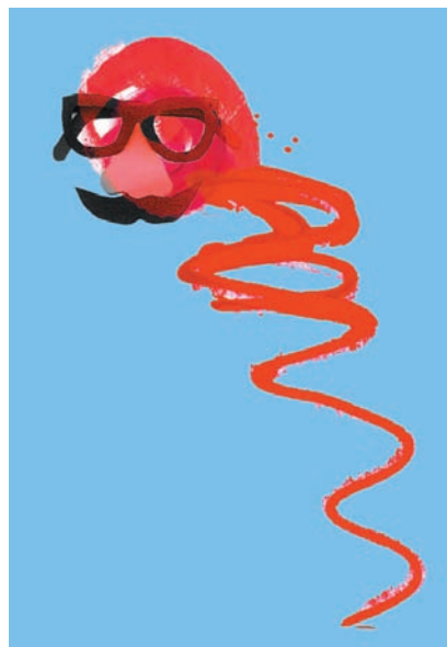
Illustration Simon Pemberton

There is a dichotomy between what people say they want to see in zoos and what they actually engage with on zoo visits. They say they want to see animals in a 'natural' setting but actually tend to anthropomorphise.