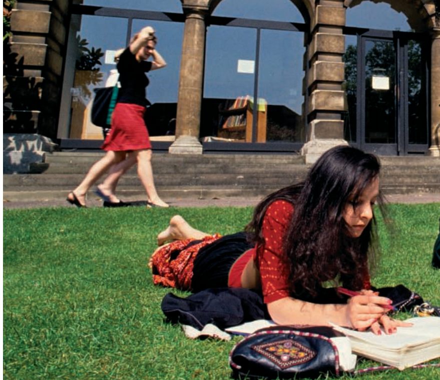
All full-time undergraduates in Britain today pay tuition fees of up to £3,000, regardless of family income.

The proportion of tuition fee income spent on bursaries ranges between 11 and 78 per cent, while the value of the bursaries on offer ranges from £300 to £5,000 a year. This means there is a considerable difference between what the Americans call the 'sticker price' of £3,000 and the discounted