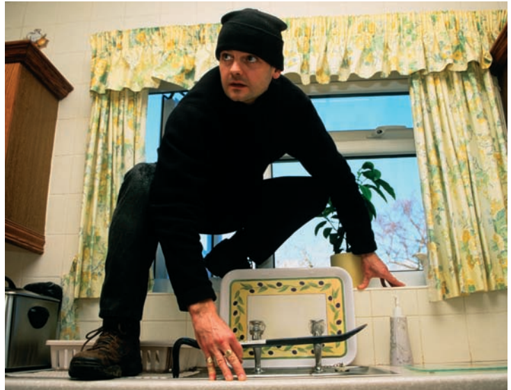
There have been modest reductions in crime rates as a result of PPO pilot schemes, notable for burglary and vehicle crime.

So how do PPO schemes work? The target population of persistent offenders is identified from the volume and nature of crimes they commit and how damaging those individuals are to their local community. Local area agencies in charge of crime prevention then work together to reach the PPO's three stated goals: 'prevent and deter';